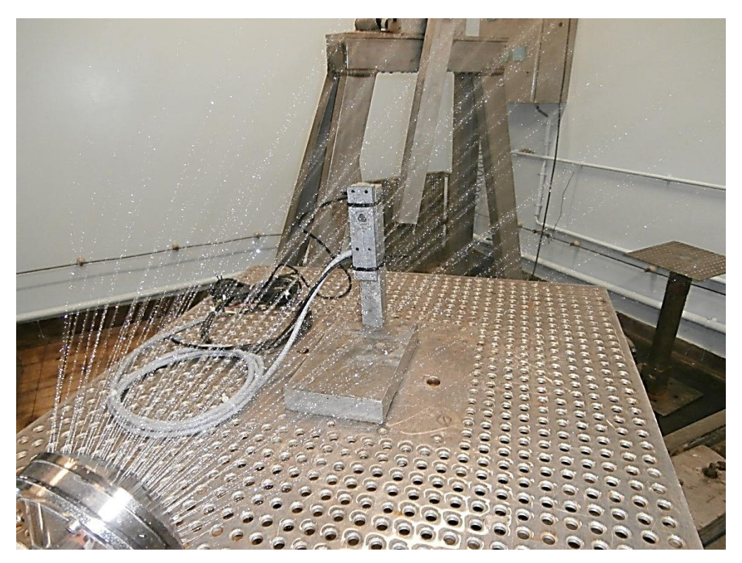
Photograph N°4: Equipment during test for the protection against penetration of water (IPX4).