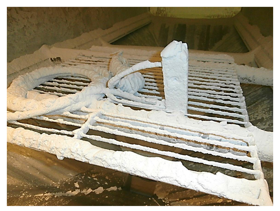
Photograph N°2: Equipment after test for the protection against ingress of dust (IP5X).