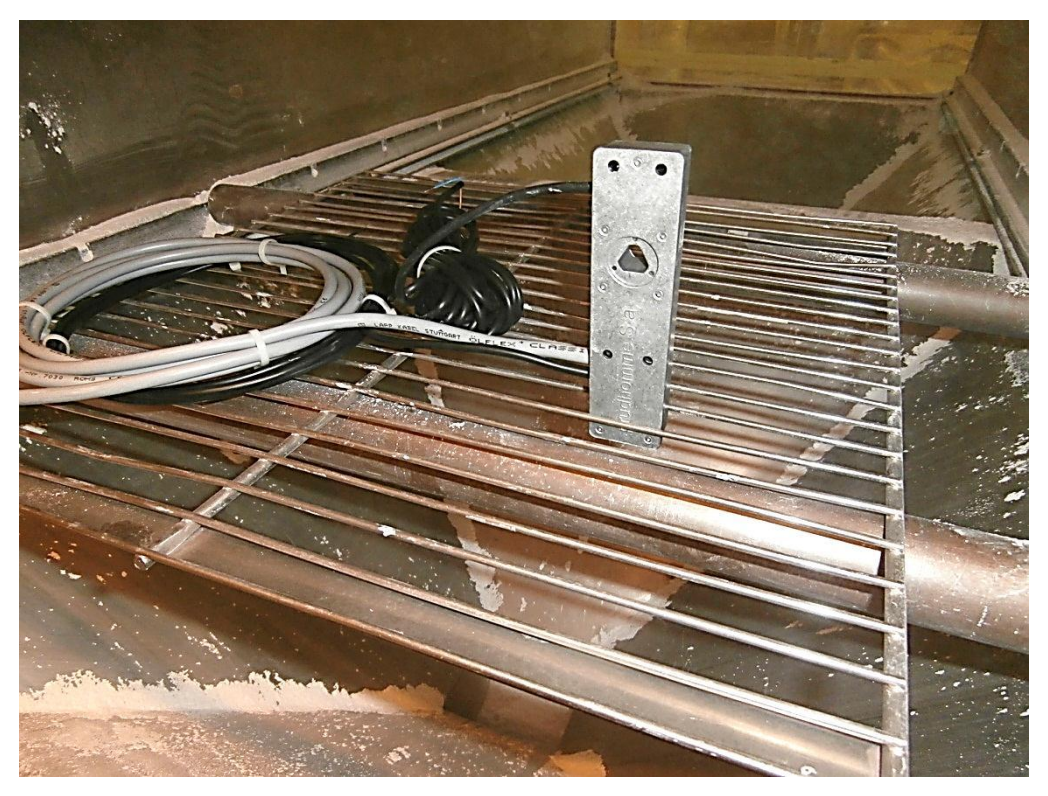
Photograph N°1: Equipment before test for the protection against ingress of dust (IP5X).